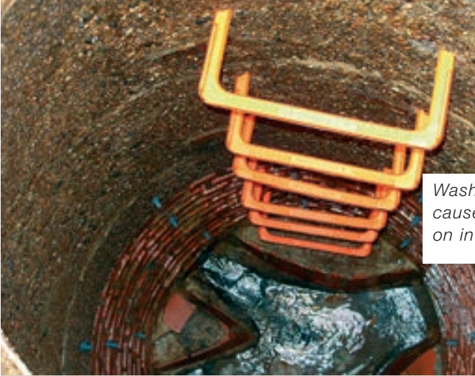
Washed concrete look caused by acid corrosion in a manhole.

Biogenic sulphuric acid generated by the bacteria Thiobacillus in gas-sealed manholes, slurry systems or biogas plants rapidly lead to heavy concrete corrosion. Washed concrete appearance and decomposed metal components are typical signs of damage such as corrosion, crack formation and leakage. The result can be instability of the structure as well as infiltration.