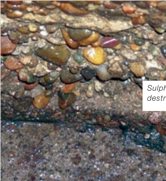
Sulphuric acid has destroyed the concrete.

Attack by acids can be stopped by the seamlessly sprayed barrier-film of 2K Polyurea Elastocoat. Elastocoat seals long-term. Curing in seconds, the »liquid film« moulds itself to all shapes of surface achieving a trouble-free sealing of vertical surfaces. It has excellent crack-bridging properties with 400% elongation at break. The result is a high-grade and durable repair.