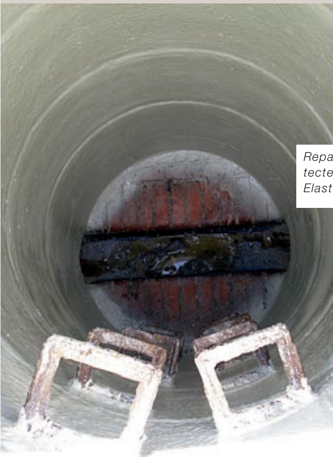
Repaired and protected long-term by Elastocoat.