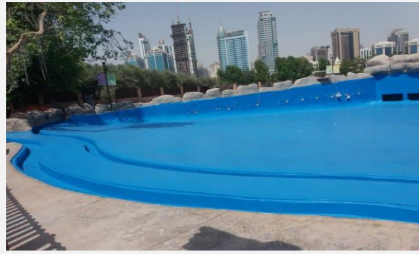
After – Elastocoat application