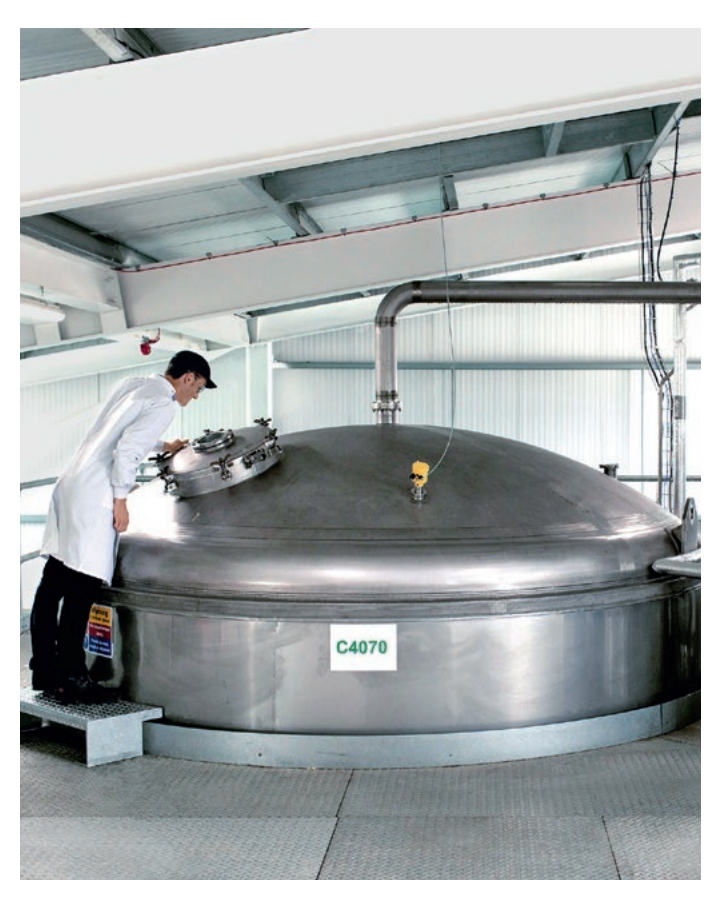
At its site in Littlehampton, BASF breeds nematodes in a 102,000-liter fermenter tank, spanning several levels.

we can offer an individual and flexible solution tailored to meet the particular problem and local conditions. This is also a very important consideration in counteracting and preventing insect pests and plant pathogenic fungi from becoming resistant to certain chemical crop protection agents," Liebmann pointed out.