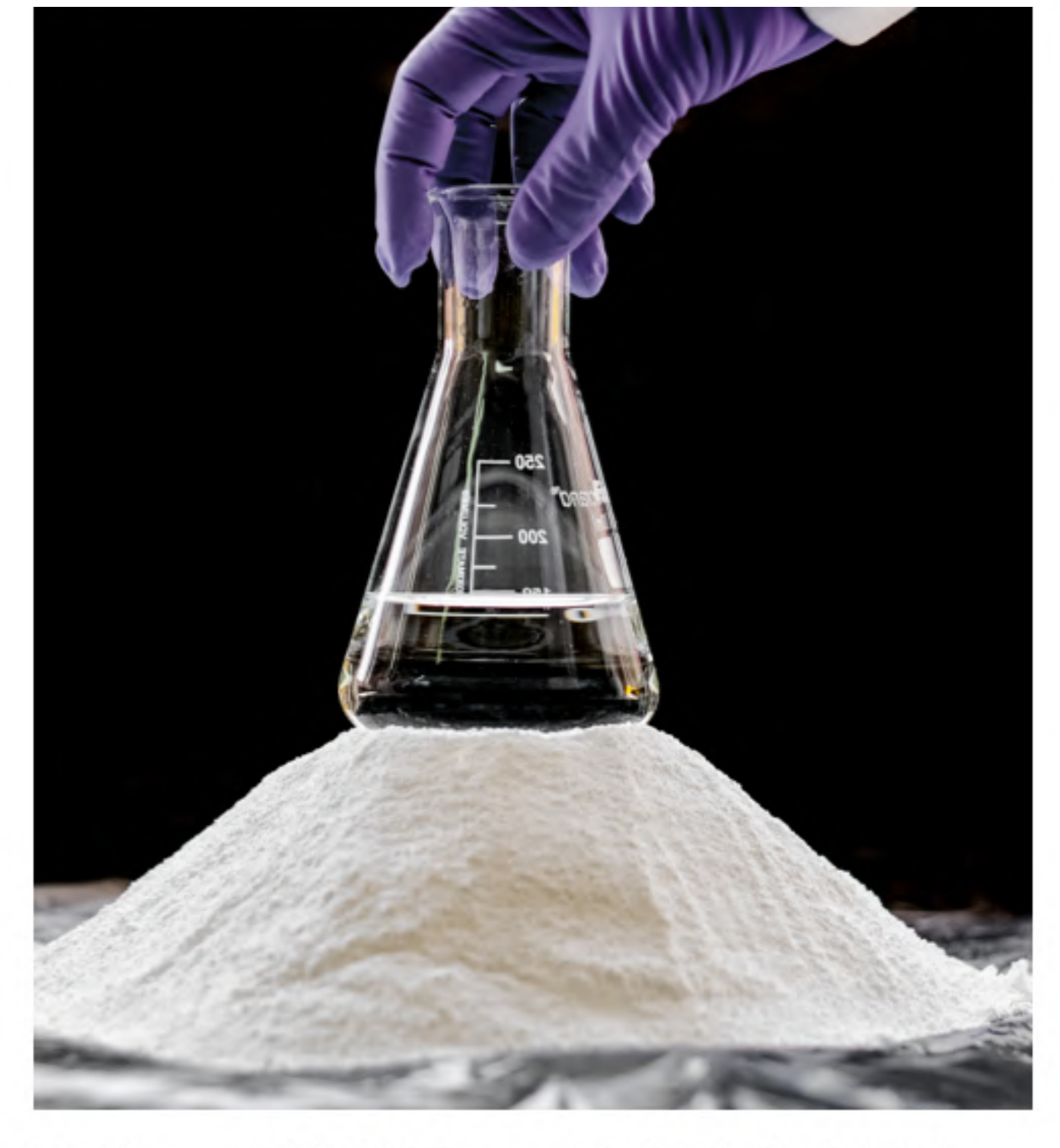
PTA and MEG from DePoly's PET chemical recycling process

In 2023, BASF Venture Capital and Wingman Ventures co-led DePoly's