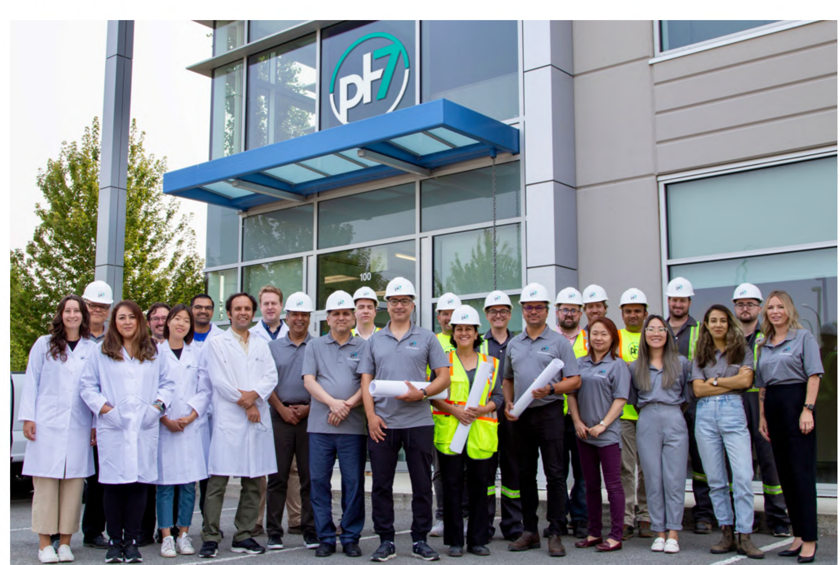
Poised for growth and expansion, pH7 currently operates a pilot plant and is constructing its first commercial facility due to open in first half of 2024.

FortePhest was established in 2017 to create herbicides with a new mechanism of action (MOA). The company's cutting-edge crop protection platform aims to control herbicideresistant weeds. In 2023, after a further investment round, the company achieved a critical milestone and successfully patented a new generation of novel, eco-friendly, and potent herbicides.