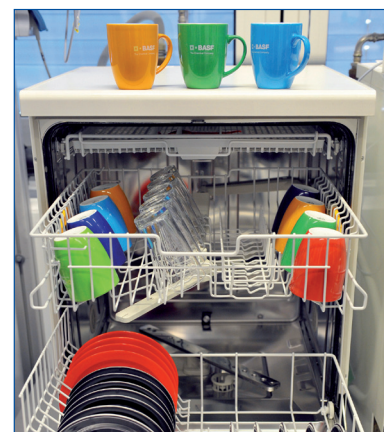
BASF supplies components for dishwashing tabs to cleaning agent manufacturers worldwide.