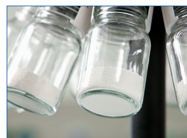
The chelating agent Trilon® M offers an alternative to phosphate in dishwashing tabs and is readily biodegradable.

BASF SE 67056 Ludwigshafen, Germany Phone +49 621 60-0 Fax +49 621 60-92693 http://www.basf.com E-mail: presse.kontakt@basf.com