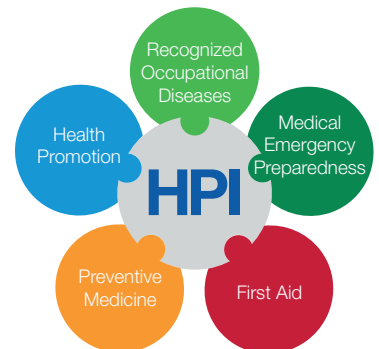
The five components of the BASF Health Performance Index

The HPI was developed by BASF along the requirements of the Global Reporting Initiative™ (GRI) (Table). The GRI key indicators LA7 and LA8 cover topics from the fields of occupational medicine and health protection.