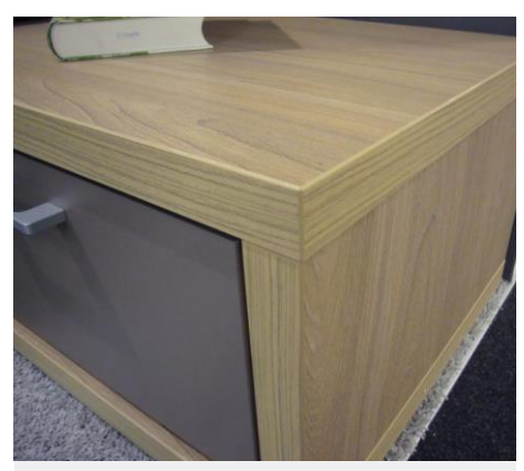
Suitable for wood and industrial coatings